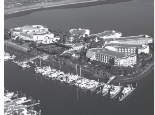
LOEWS CORONADO RESORT